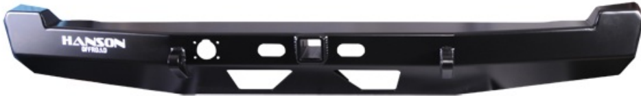
SHOWN WITH STOCK HARDWARE (WILL NEED TO BE RETAINED FROM THE VEHICLE)